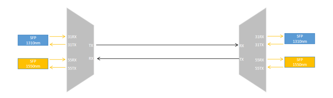
2CH CWDM MUX DEMUX Dual fiber transmission

2Channels CWDM MUX DEMUX, support 2 channels difference business, such applications as 1G/10G Ethernet, SDH/SONET and 8/4/2/1G, in two optical fiber for point-to-point transmission.